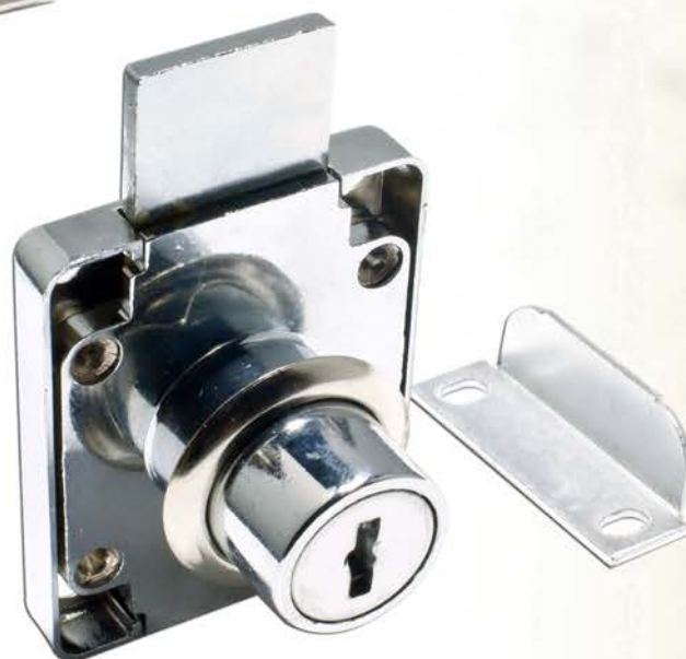
A339/1 RECTANGLE BASE:39x50x7mm