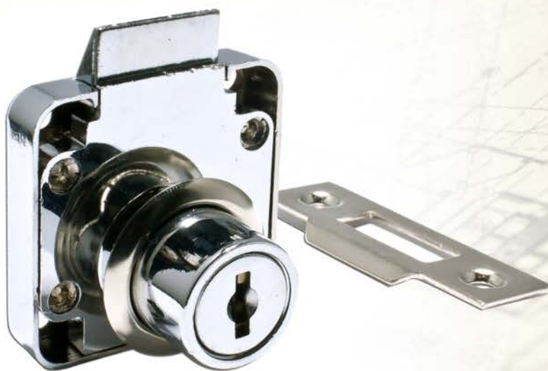
A220-338 RETRACTABLE LATCH LATCH: (W)20mm