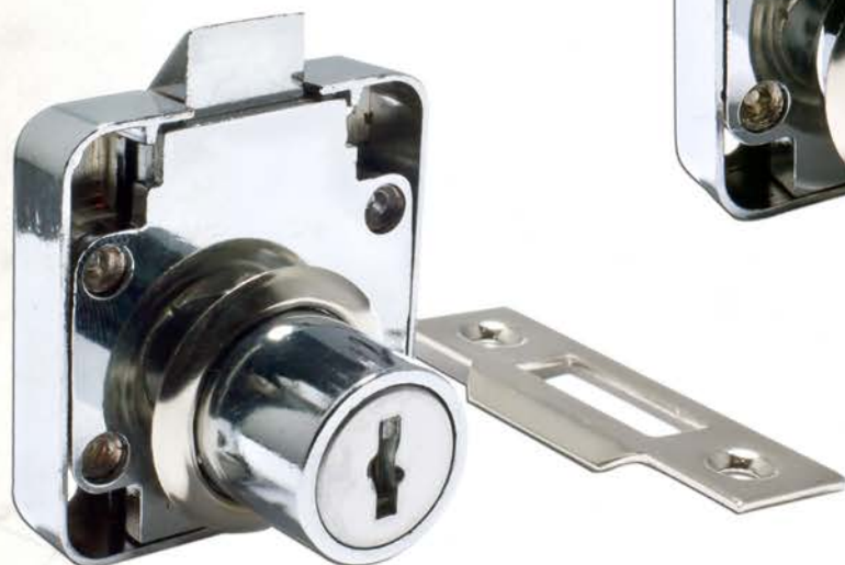
A220-338NEW RETRACTABLE LATCH LATCH: (W)12mm