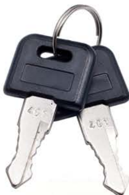
PLASTIC CAP KEYS